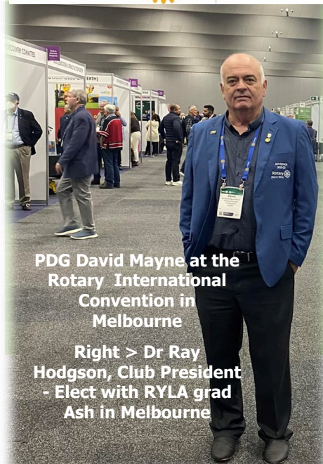
PDG David Mayne at the Rotary International Convention in Melbourne

INTERNATIONAL CONVENTION 27-31 MAY 2023 MELBOURNE, AUSTRALIA