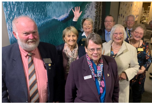
Big Dig raising over $20K and their ongoing work

can raising $100K and getting into the Guinness Book of Records with over 10klms of socks on a washing line. Congratulations also the Sunrise for their