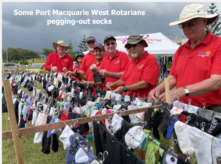
Some Port Macquarie West Rotarians pegging-out socks

Spearheaded by the Port Macquarie West Rotary Club and supported by the Rotary Clubs in our cluster, Rotary is endeavouring to break the world record for the longest line of socks! A significant event to celebrate Port Macquarie's Centenary in April 2021, Rotary is hoping to build a 10,000 metre clothes line and peg 100,000 socks! The Guinness World Record was set on 17th May 2014 in Halvania, Germany where a 6,066 metre clothes line hung 69,152 socks.