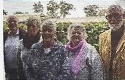
Fellowship of Australian Writers - Port Macquarie-Hastings