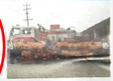
NSW RFS - Lake Cathie Brigade

The Port Macquarie ROTARY Club has been nominated for the COMMUNITY GROUP OF THE YEAR for the January 26th Australia Day Awards. We are one of six nominations. The winner to be announced on Australia Day.