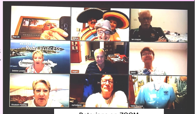
Rotarians on ZOOM

Next week the club board will be meeting via ZOOM.