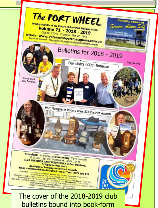
The cover of the 2018-2019 club bulletins bound into book-form