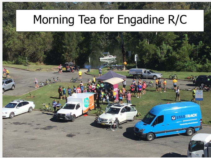
Morning Tea for Engadine R/C