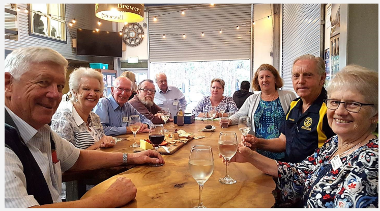
Some of our group enjoying pre-dinner drinks.