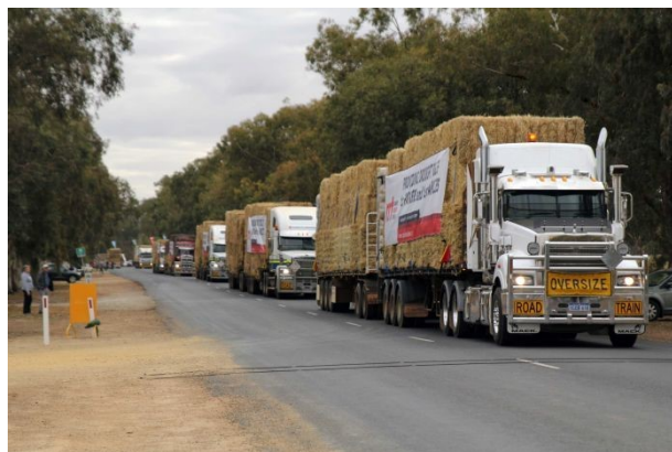
WA hay convoy arrives in Condobolin, carrying 2,000 hay bales, a gift from WA farmers & truckies.