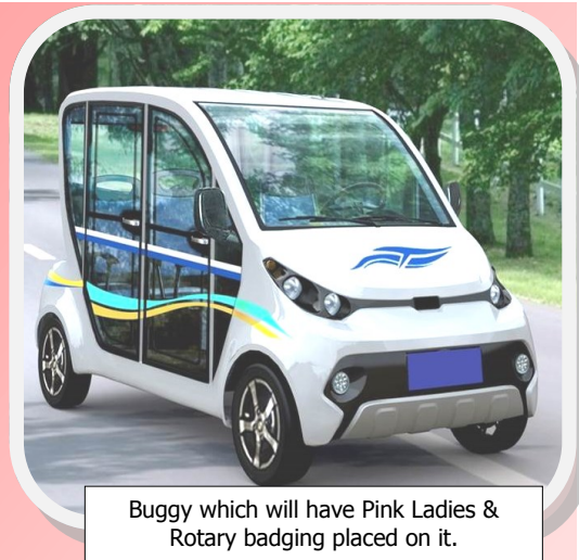
Buggy which will have Pink Ladies & Rotary badging placed on it.