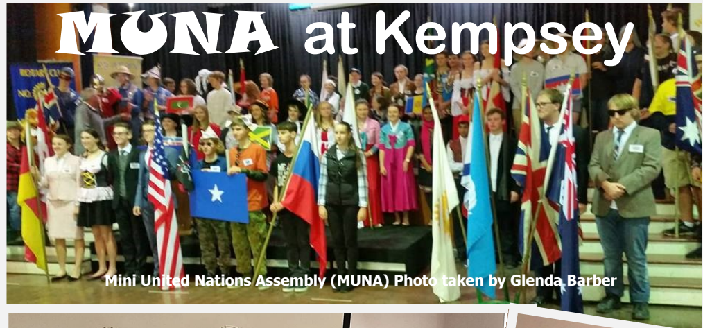
Mini United Nations Assembly (MUNA)