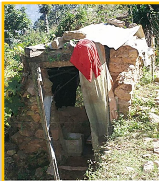
A dummy in < Nepal